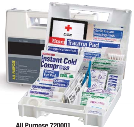
All Purpose 720001

This rugged and portable kit offers a broad selection of supplies for all your first aid needs.