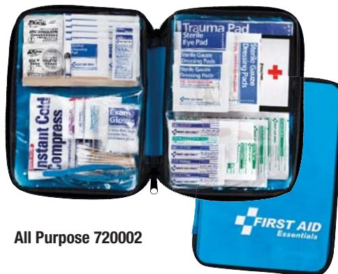
All Purpose 720002

Easy to carry, this soft case kit is handy at home and in the car.